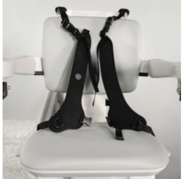
Not all options are shown.